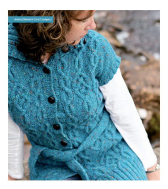
Ardara: Women's Tunic Cardigan (Click for pattern)