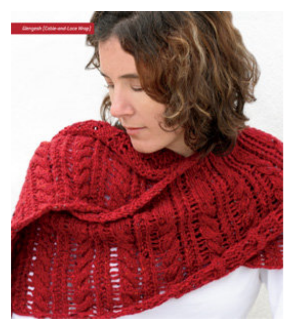
Glengesh: Cable-and-Lace Wrap (Click for pattern)